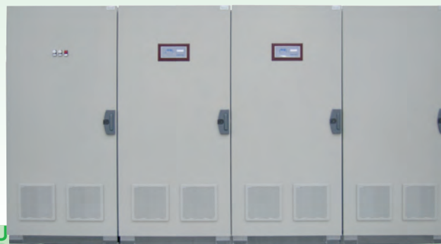
AC & DC POWER SUPPLY FOR CONVERTER'S TESTING.