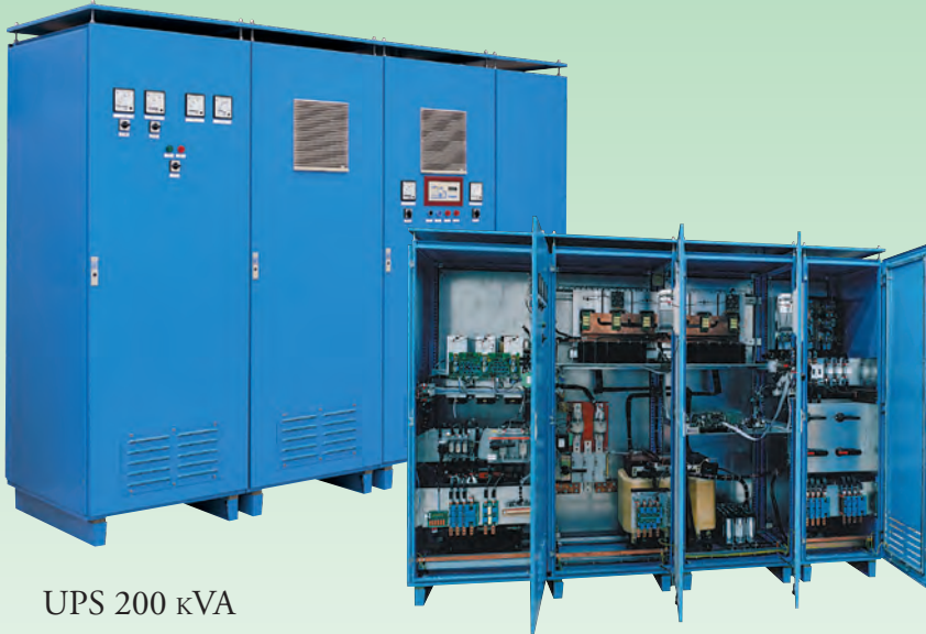
UPS 200 kVA ACCORDING TO RINA-LLOYD REGISTER STANDARDS FOR NAVAL APPLICATION