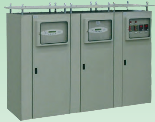
REDUNDANT UPS SYSTEMS FOR NAVAL APPLICATIONS (MILITARY)